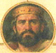
Herod Agrippa I