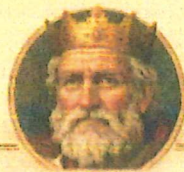
Herod the Great