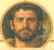
Herod Agrippa II