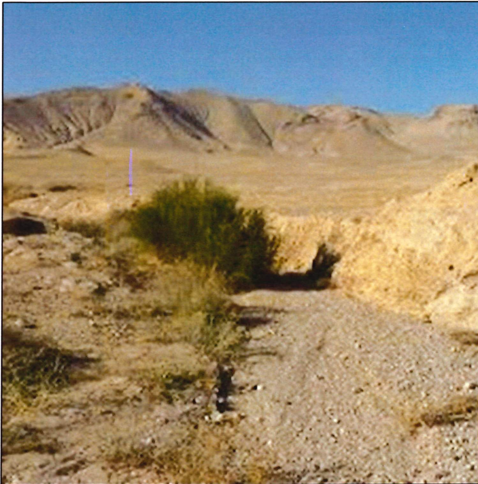
The Valley of Achor

When we fool ourselves into thinking we can simultaneously (1) live with our sin without consequences and (2) keep it hidden, our sin will find us out every time. The consequences run further & deeper than just ourselves.