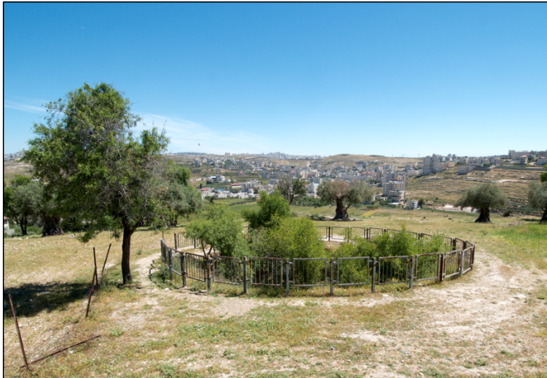
Pool of Gibeon

12 Abner the son of Ner, and the servants of Ish-bosheth the son of Saul, went out from Mahanaim to Gibeon. 13 And Joab the son of Zeruiah and the servants of David went out and met them at the pool of Gibeon. And they sat down, the one on the one side of the pool, and the other on the other side of the pool. 14 And Abner said to Joab, "Let the young men arise and compete before us." And Joab said, "Let them