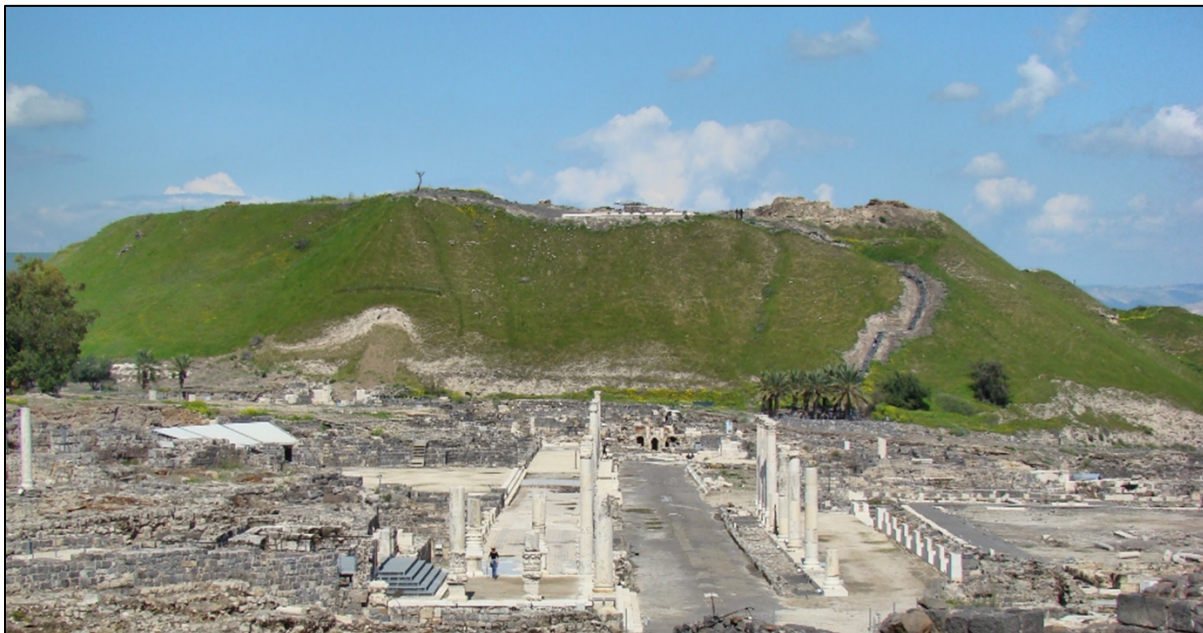
Current-day photo of Beth Shan.

8 The next day, when the Philistines came to strip the slain, they found Saul and his three sons fallen on Mount Gilboa. 9 So they cut off his head and stripped off his armor and sent messengers throughout the land of the Philistines, to carry the good news to the house of their idols and to the people. 10 They put his armor in the temple of Ashtaroth, and they fastened his body to the wall of Beth-shan. 11 But when the inhabitants of Jabesh-gilead heard what the Philistines had done to Saul, 12 all the valiant men arose and went all night and took the body of Saul and the bodies of his sons from the wall of Beth-shan, and they came to Jabesh and burned them there. 13 And they took their bones and buried them under the tamarisk tree in Jabesh and fasted seven days.