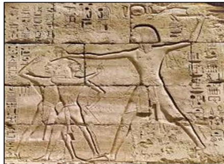
Depicted in Karnak temple in modern-day Luxor