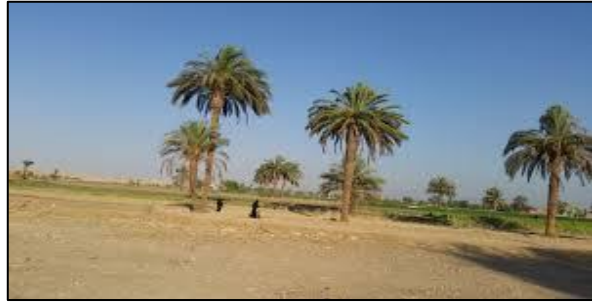
Elim (Ain Harawah) in present-day Sinai